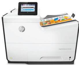
HP PageWide Managed Color E55650dn

HP Managed MFPs and printers are optimized for managed environments. Offering increased monthly page volumes and fewer interventions, this portfolio of products can help reduce printing and copying costs. See your HP Authorized Reseller for details.