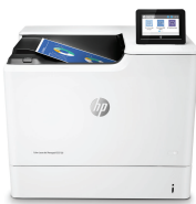
HP Color LaserJet Managed E65150dn

Dynamic security enabled printer. Only intended to be used with cartridges using an HP original chip. Cartridges using a non-HP chip may not work, and those that work today may not work in the future. http://www.hp.com/go/learnaboutsupplies