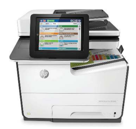
HP PageWide Managed Color Flow MFP E58650z