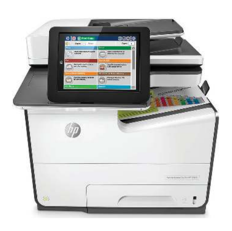
HP PageWide Managed Color MFP E58650dn