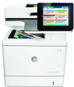
HP Color LaserJet Enterprise MFP M577f