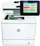
HP Color LaserJet Enterprise MFP M577dn