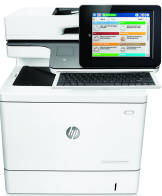
HP Color LaserJet Enterprise Flow MFP M577c