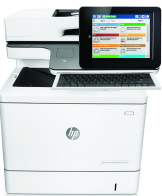
HP Color LaserJet Enterprise Flow MFP M577z